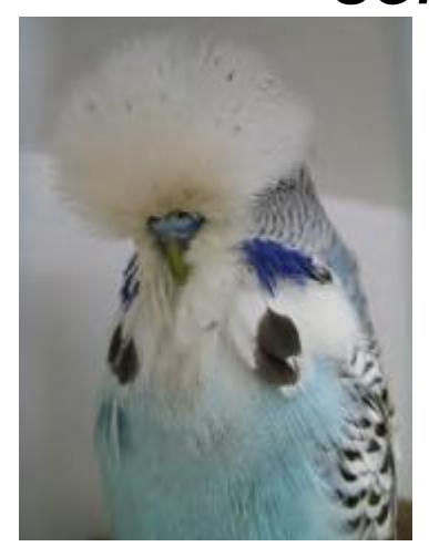
O'Callaghan Family: Cinnamon