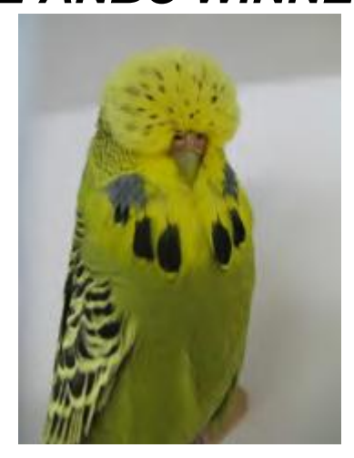
Welchman Family: Grey Green